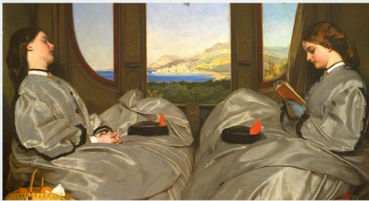
The Travelling Companions by Augustus Leopold Egg

With this in mind, make a response in any media on the theme of travel and journeys. It is a theme which could take you in many different directions with both subject and media.