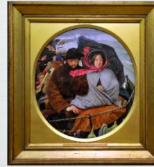
The Last of England by Ford Madox Brown

To get started, you could make a list asking yourself how or why people travel or consider journeys you have made or would like to make